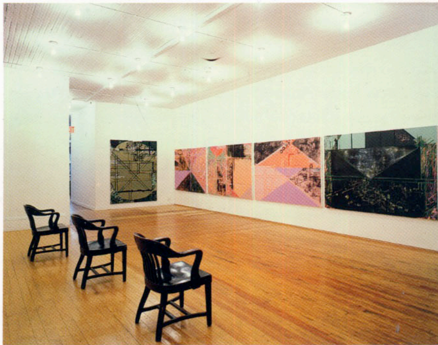
INSTALLATION VIEW. TOM CUGLIANI GALLERY, NEW YORK. 1992