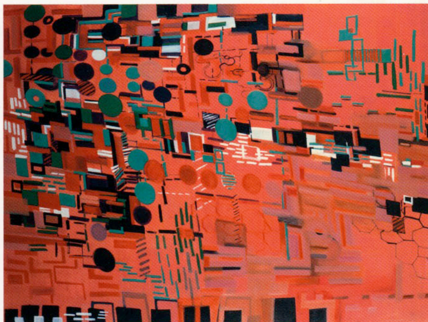
THE TOPOGRAPHIC ORIENTATION WE ARE SUPPOSED TO PROJECT INTO THE FABRIC OF CORAL DEPENDS UPON PARTICLES AND CODES OF DESIRE, 1987